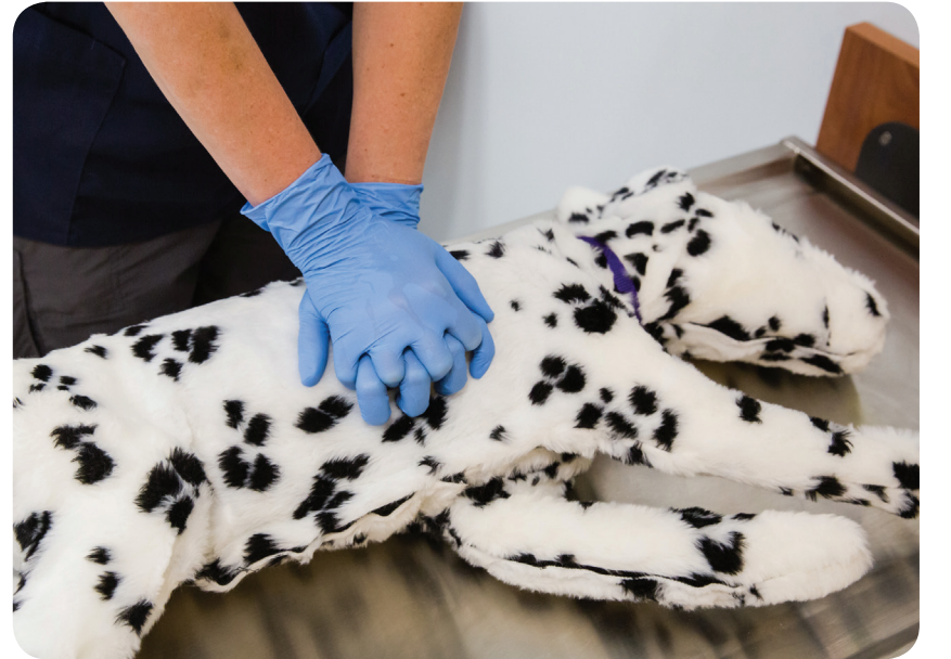
2-handed compressions Suitable for large dogs