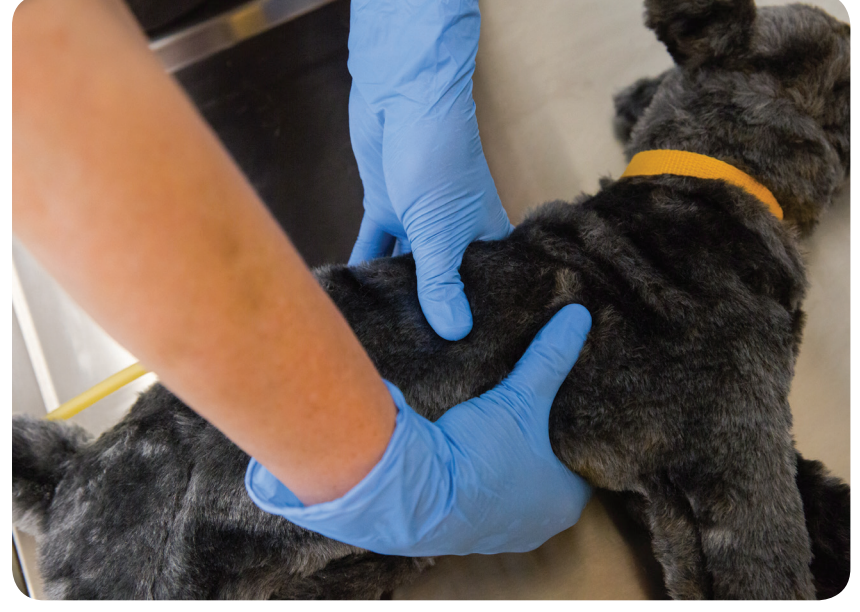
1-handed compressions Suitable for small dogs and cats