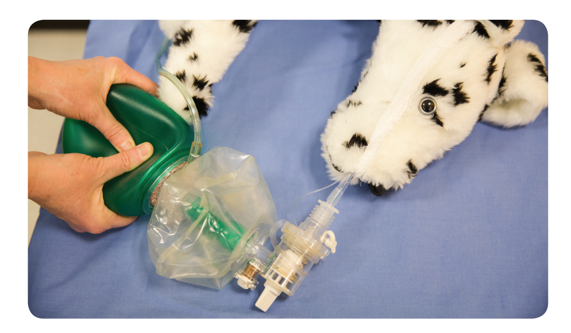
Resuscitation bag used to provide ventilation

Mouth to snout ventilation at C:V of 30:2